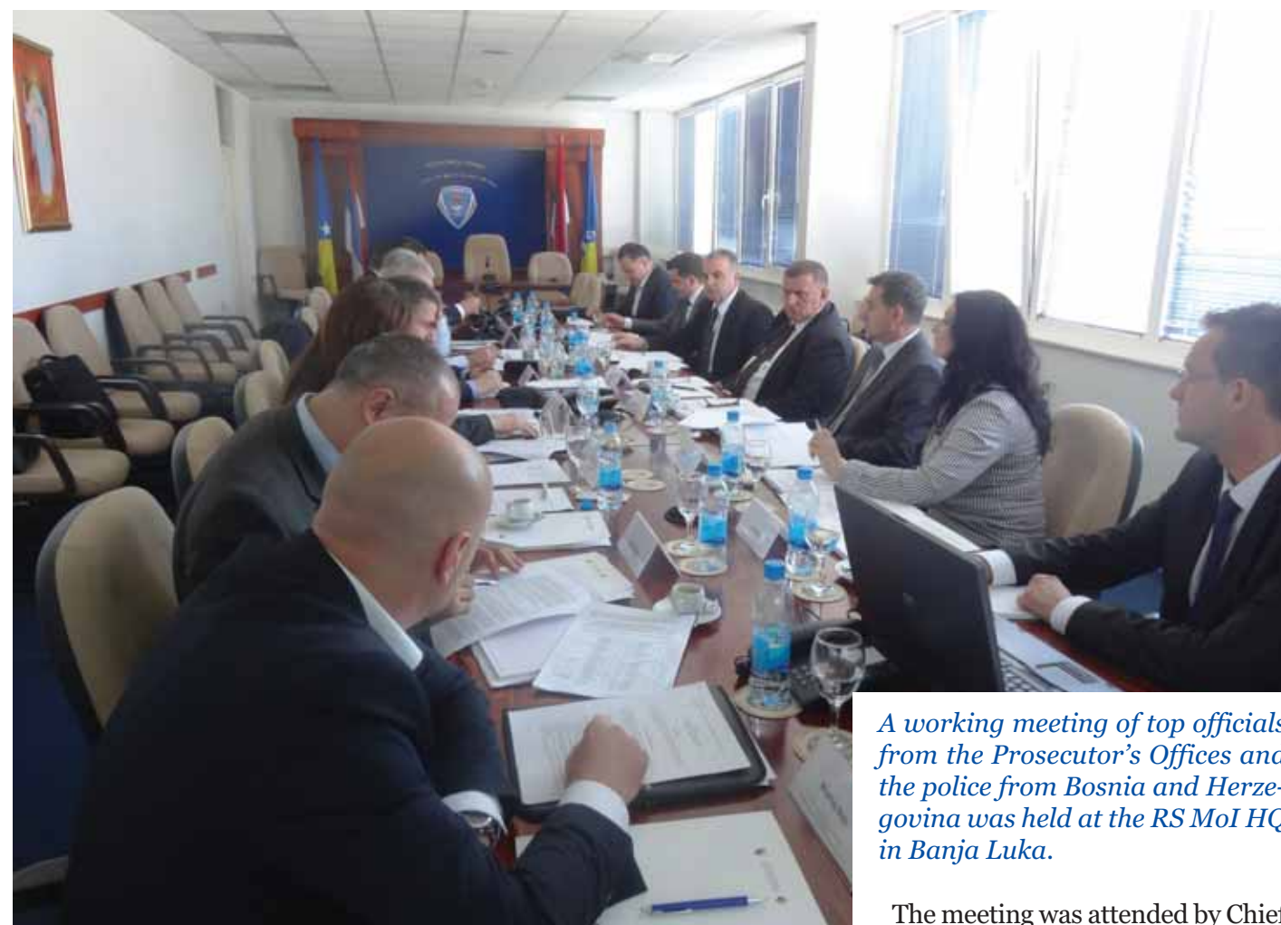
A working meeting of top officials from the Prosecutor's Offices and the police from Bosnia and Herzegovina was held at the RS MoI HQ in Banja Luka.