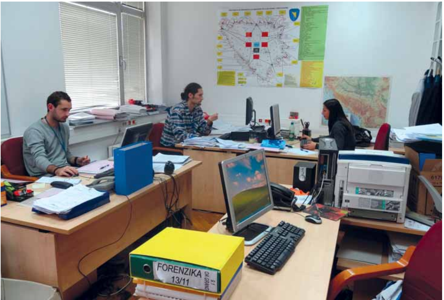
■ Associates of the Special Department for Organized Crime, Economic Crime and Corruption