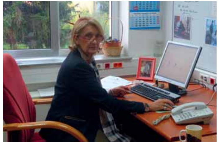
■ Slavica Terzić, Prosecutor of the Special Department for War Crimes