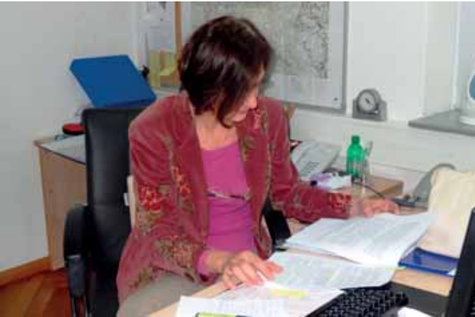
■ Zorica Đurđević, Prosecutor of the Special Department for War Crimes