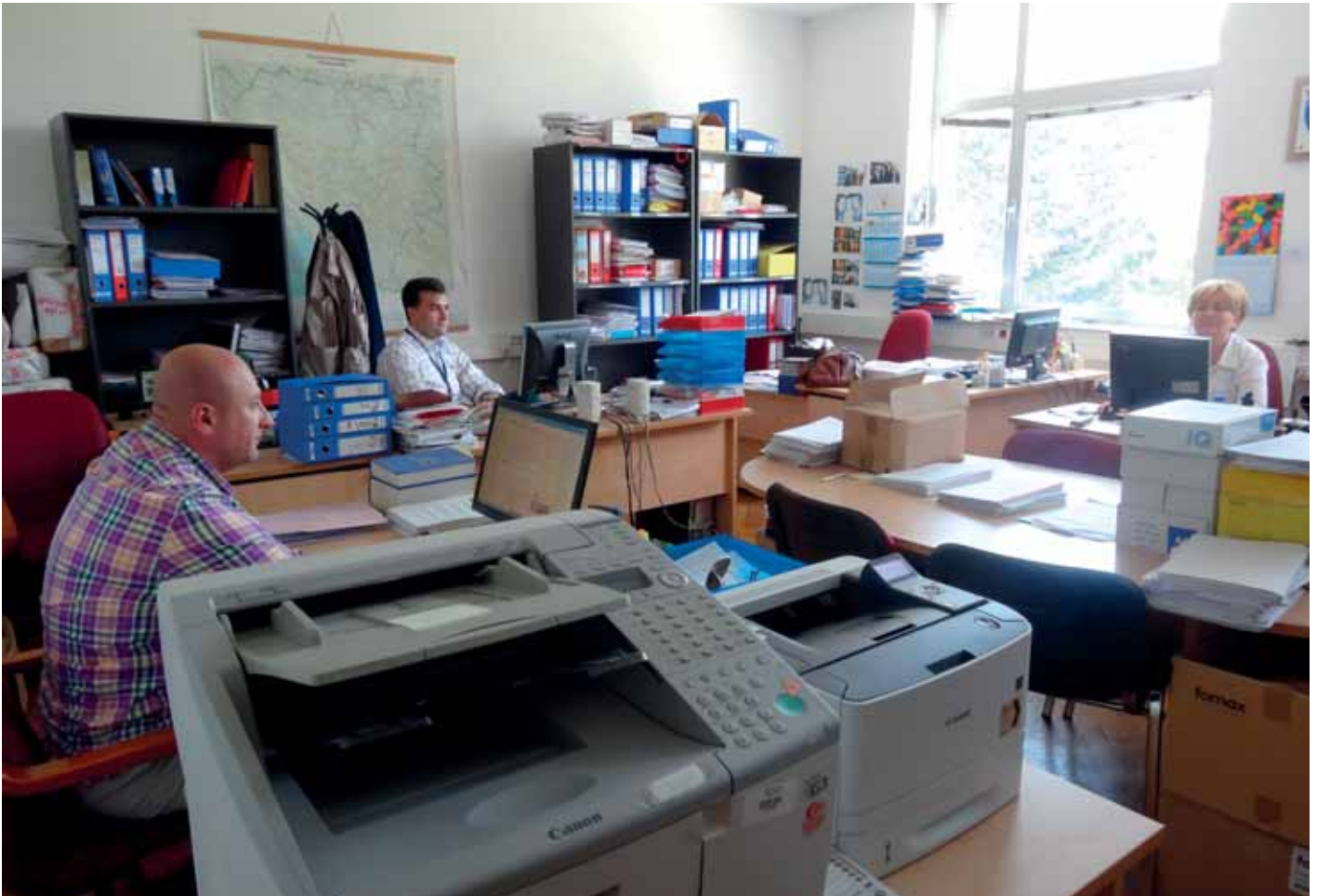
■ Oleg Čavka, Prosecutor of the Special Department for Organized Crime, Economic Crime and Corruption, with his associates

The increase of prosecutorial capacities is a precondition for expediting the work on cases, which includes prosecutors and additional support staff, and it is nec-