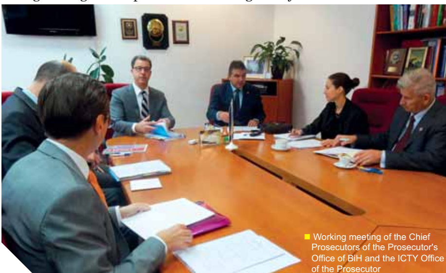
■ Working meeting of the Chief Prosecutors of the Prosecutor's Office of BiH and the ICTY Office of the Prosecutor

It was concluded that successful cooperation of the two Prosecutor's Offices would continue in future, with the common goal to detect and criminally prosecute perpetrators of war crimes. ■