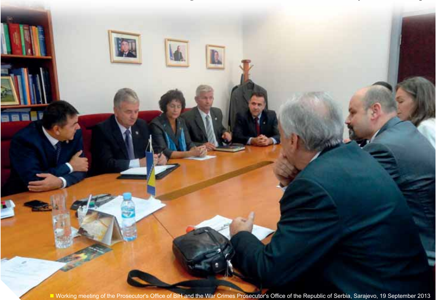
■ Working meeting of the Prosecutor's Office of BiH and the War Crimes Prosecutor's Office of the Republic of Serbia, Sarajevo, 19 September 2013

"Joint cooperation in war crimes cases must be further developed