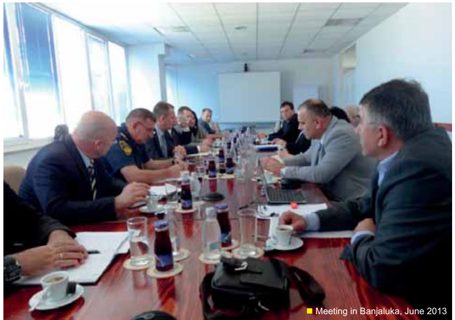
Meeting in Banjaluka, June 2013

The meeting participants also discussed the sanctioning of police officers who were detected in commission of criminal offences. Specifically, it was concluded that such phenomena must effectively