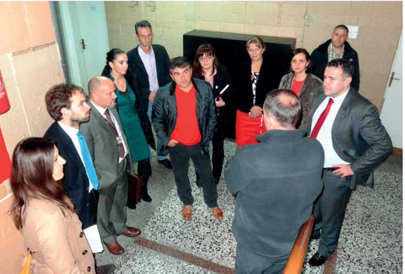
■ Chief Prosecutor and representatives of the European Commission taking a tour of the facilities and premises for a separate building of the Prosecutor's Office of BiH