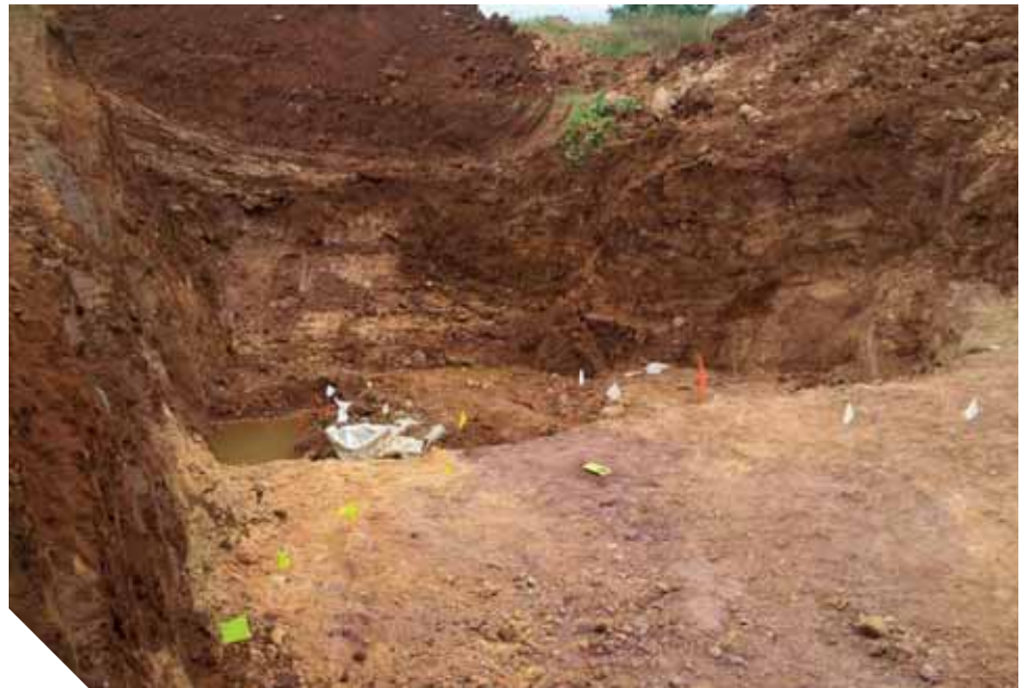
■ Exhumation at the mass grave site in Tomašica near Prijedor

This assistance is greatly needed because the current method of search for mass graves could take dec-