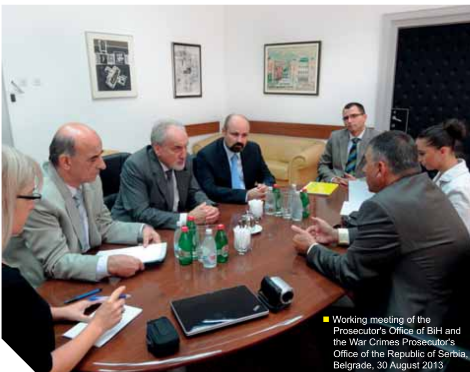
■ Working meeting of the Prosecutor's Office of BiH and the War Crimes Prosecutor's Office of the Republic of Serbia, Belgrade, 30 August 2013

It was agreed that the joint meetings shall be held continuously every two months, to discuss specific activities related to joint cooperation in the mutual interest of both institutions. ■