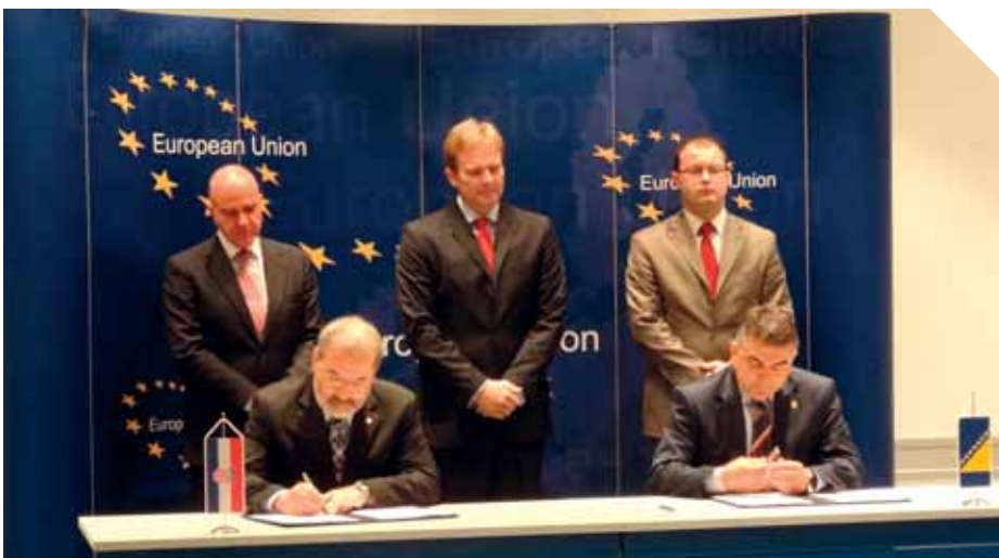
■ Signing of the Protocol on Cooperation between the Prosecutor's Office of BiH and the State Attorney's Office of the Republic of Croatia, Sarajevo, 03 June 2013

The signing of the protocol was also supported by the International Criminal Tribunal for the former Yugoslavia (ICTY) in The Hague, officials of the European Union and the U.S. Department of Justice. ■