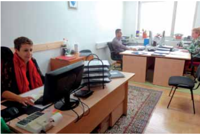
■ Department for Material and Financial Operations of the Prosecutor's Office of BiH